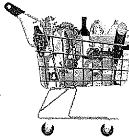
Figure 2: Shopping cart